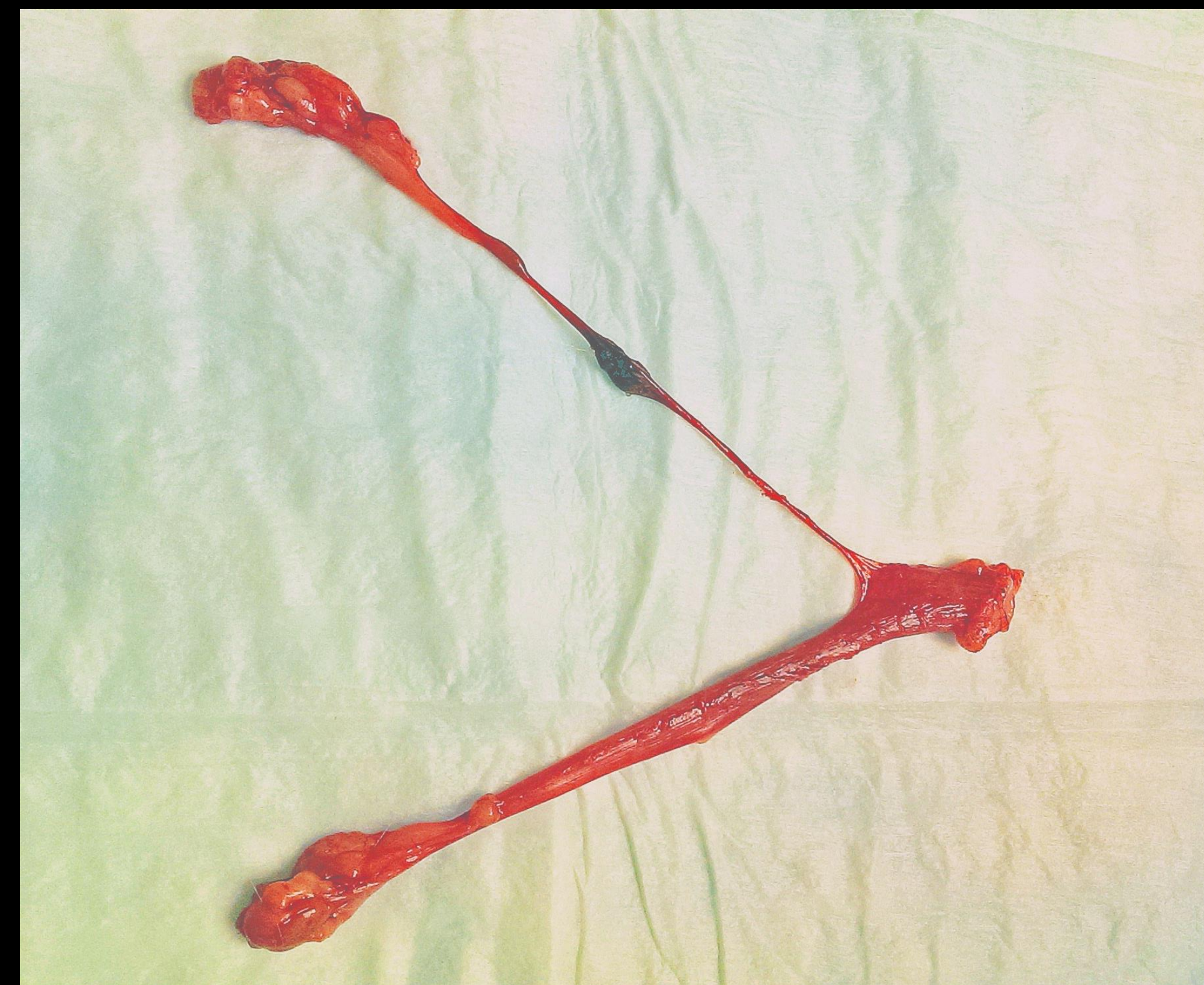
Figure 2 (left): Following euthanasia, the uterus and ovaries were removed. One uterine horn was thin with a brown-black necrotic focus present in the middle of the horn. The necrotic focus is likely remnants from the fetal demise that occurred about 5 months ago.