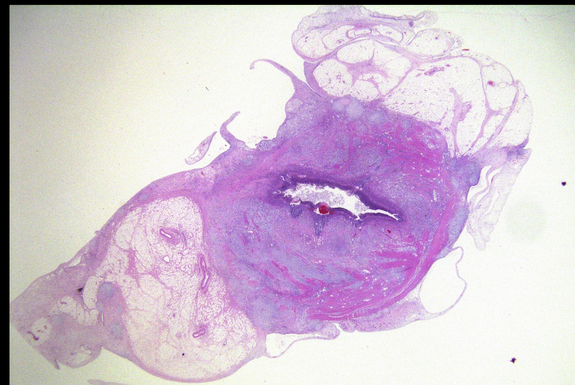
Figure 3 (left): The mass on the colon of this guinea pig was composed of numerous cystic structures, lined by flattened to cuboidal epithelioid cells, embedded in a myxomatous stroma with a fibrovascular core. The same epithelioid cells were also found forming rosettes, small clusters and single cell lined dilated tubules, some with papillary projections, within the myxomatous stroma. The mucosal surface of the colon is ulcerated at the point of tumor invasion into the wall of the colon.