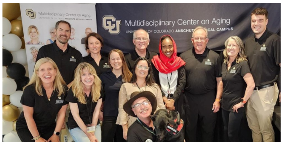
Team that participated at the Research Roadshow.

Research Roadshows feature different activities, including opportunities to try out new innovations in aging and provide feedback to research teams. One example is SteadyPlay , an innovation developed by a physical therapist-turned-engineer. The device makes balance training for fall prevention fun as participants shift their weight on a balance board to direct a car around an obstacle course. Through such user testing activities, older adults have a first-hand experience using their voice and participation to improve the products of research to make a difference in the lives of older adults.